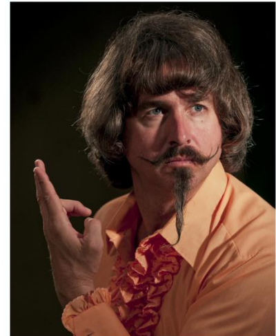
Magician and Cat lover